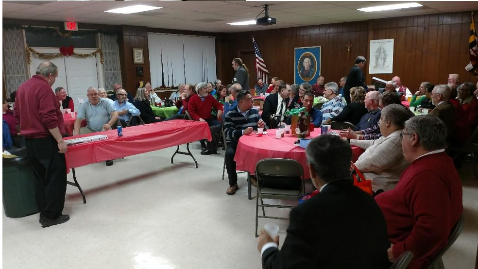
Christmas Party 2017

1994 - 1995 International Winner of the To Be a Patriot Award, Five Gold Eagle Awards, Three Bellissimo Patriotic Awards Home Assembly of a Former Master of the Fourth Degree