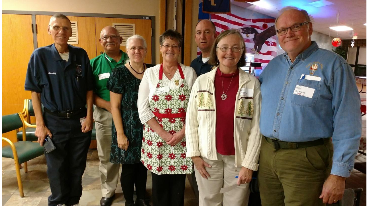
Winter Ball 2016 at Charlotte Hall Veteran's Home, together with members from Lord Baltimore Assembly.

FATHER ANDREW WHITE ASSEMBLY #377 KNIGHTS OF COLUMBUS FOURTH DEGREE